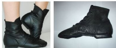
Bottines de Jazz