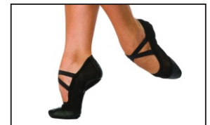
Ballet dance shoes